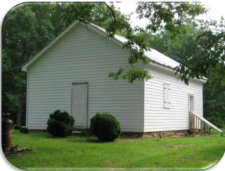
Left: Old Chapel Church Penhook, Virginia