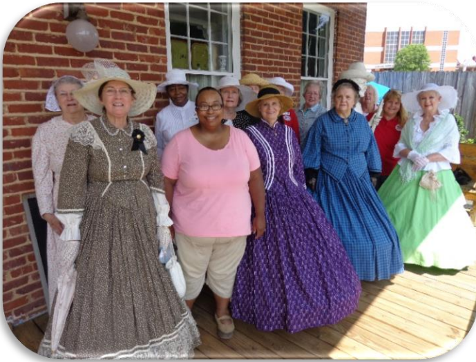
Jubal Early Chapter members at the Veteran's Memorial Day services at the History Museum, June 4 th .