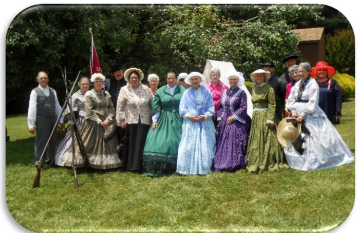
Jubal Early Members with guests at the encampment site.