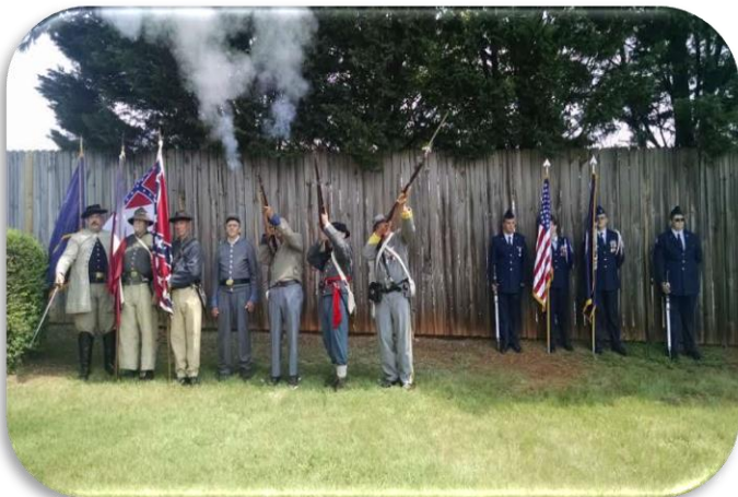
Franklin Fireaters open ceremony with a gun salute.