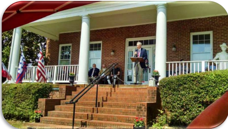
Virgil H. Goode Jr. giving he remarks at the Memorial Day Ceremony.