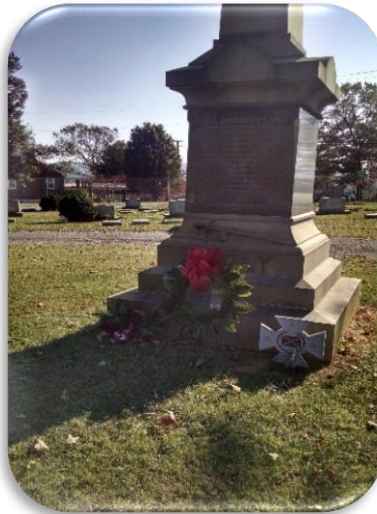
Jubal Early's Grave - Lynchburg